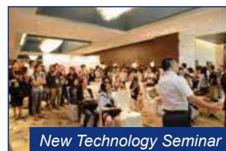
New Technology Seminar