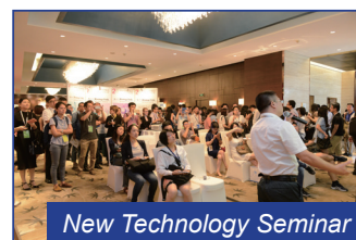
New Technology Seminar