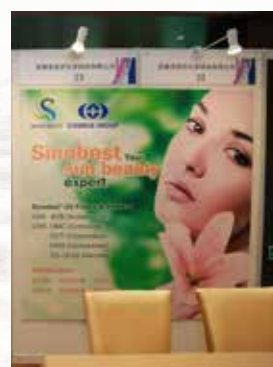
Double Opening Booth